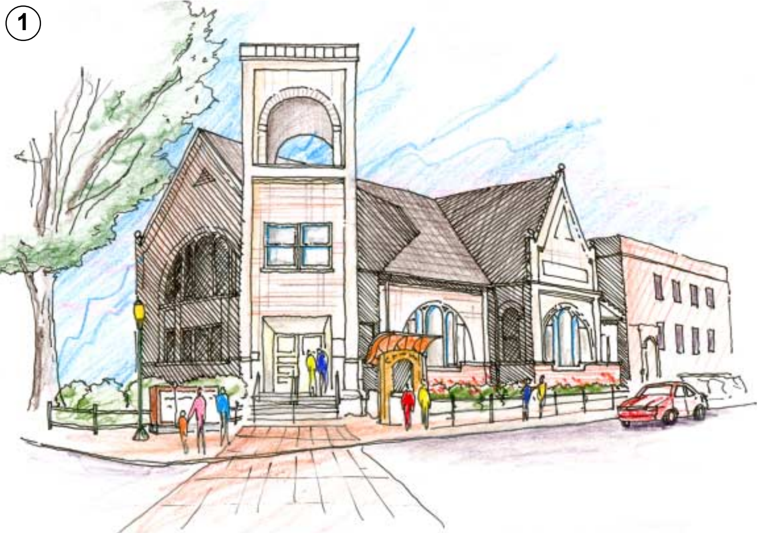
Neighborhood Fellowship Church.