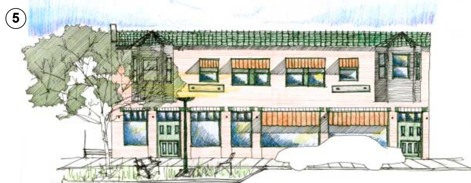
Ten de Club