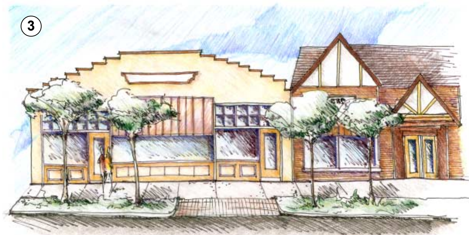
Preferred Advertising Co.