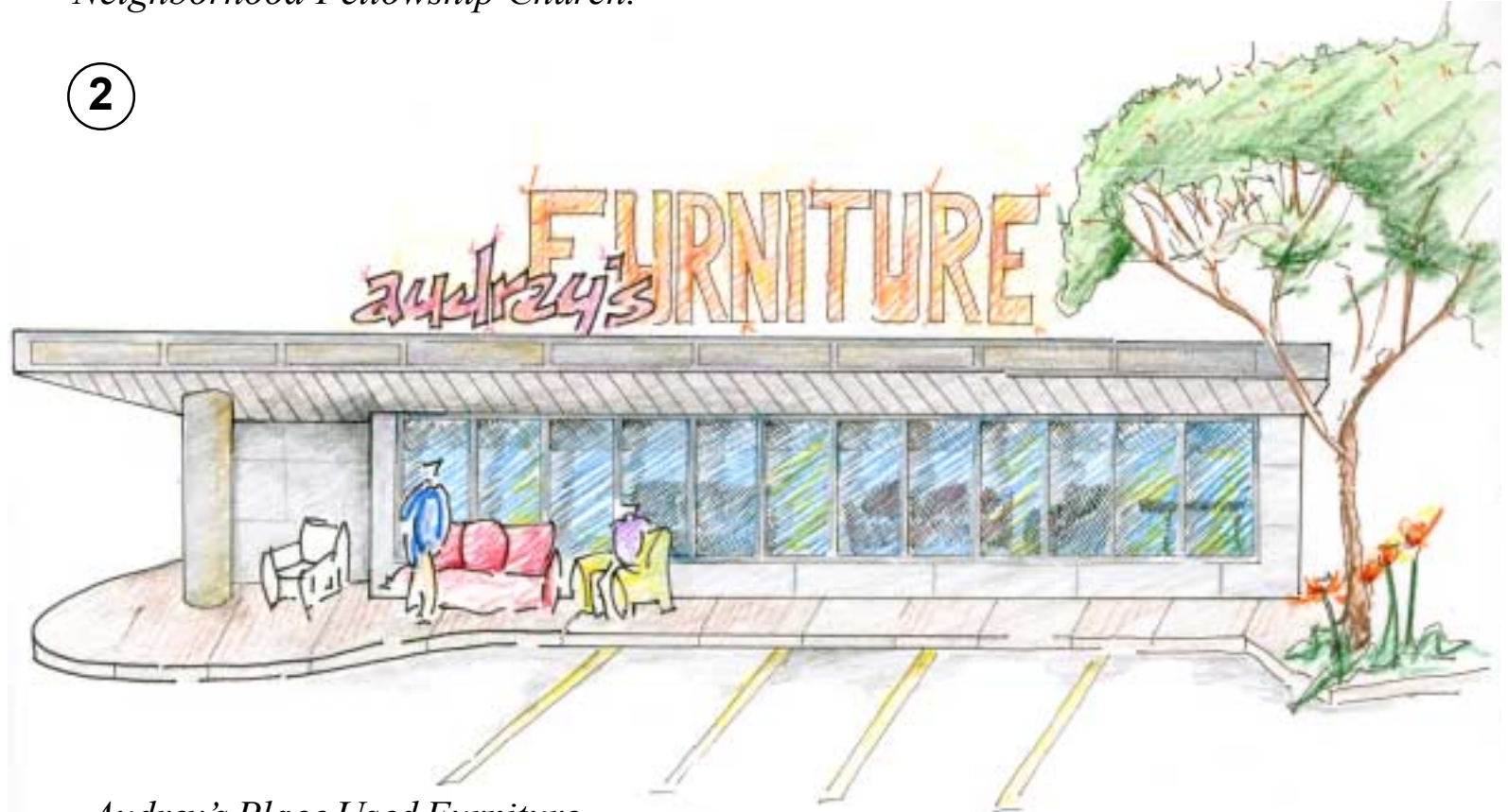
Audrey's Place Used Furniture.