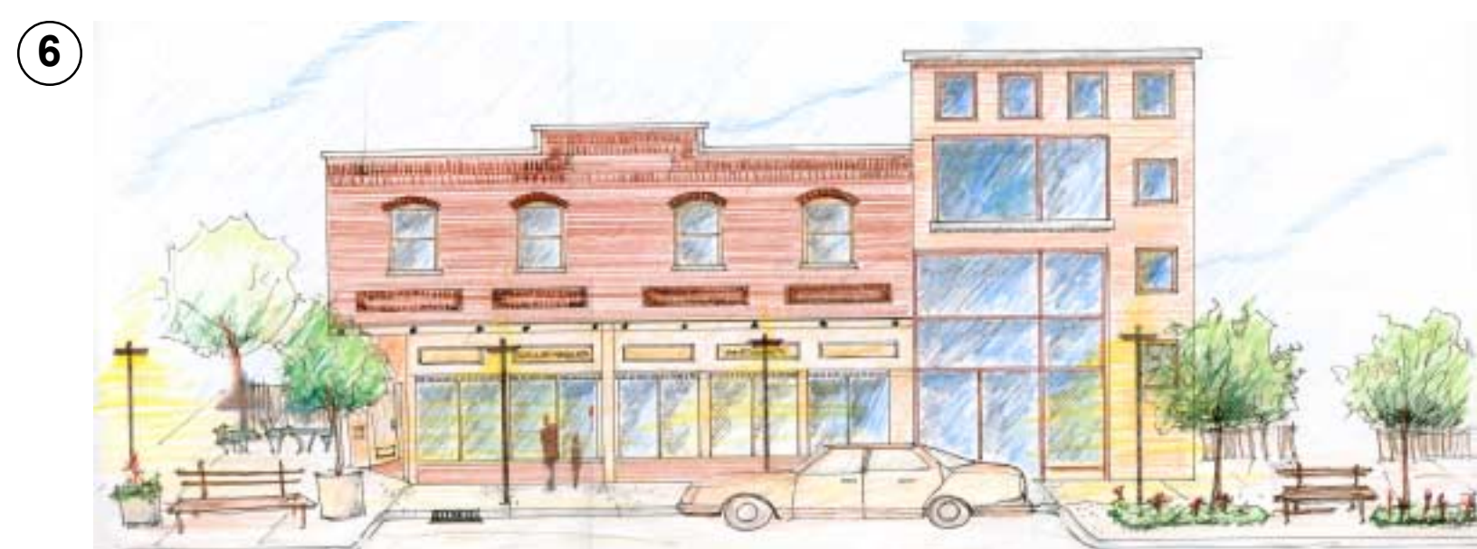
Antiques & Collectibles.