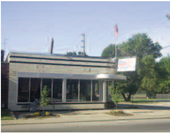
Historic City Ice Cream Company building