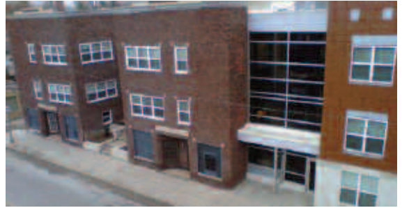
Located less than a mile from Downtown