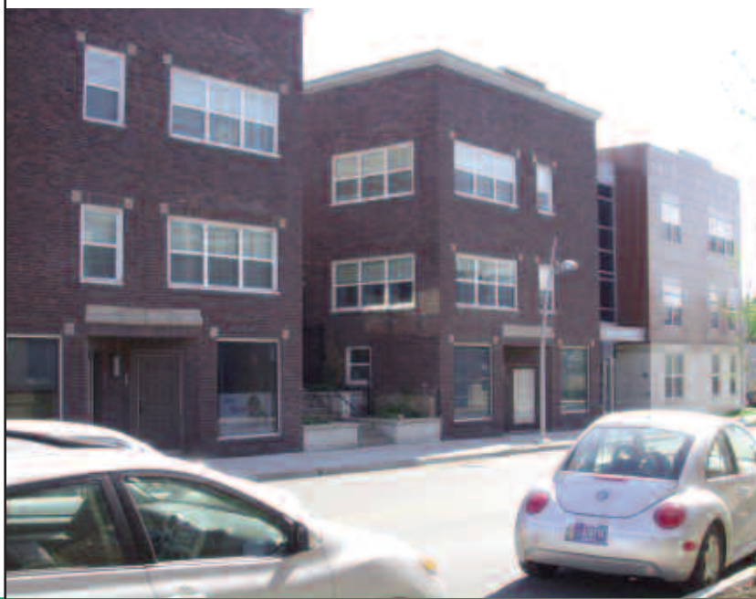
Prime office space located on busy East 10th Street